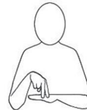
To Stand Up

Along with our word of the week, our children will now be learning some sign language. We have many pupils at Grange that are non-verbal and one of the ways in which we communicate with them is to use sign language. We want all our children to be able to communicate with each other so felt that teaching our children to sign would help this. Please help us to learn together by practising this with your child at home.