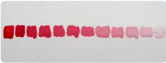
tints of red

A tint is a colour mixed with white. The more white paint that is added to the original colour, the lighter the tint. A tint can range from slightly lighter than the original colour, to almost white. When mixing a tint, begin with the pure colour and add white paint a tiny bit at a time.