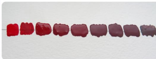
tones of red

A tone is a colour mixed with grey. Tones are less vibrant than the original colour. Using a tonal colour in a painting balances other intense colours and bright hues. When mixing a tone, begin with the pure colour and add grey paint a tiny bit at a time.