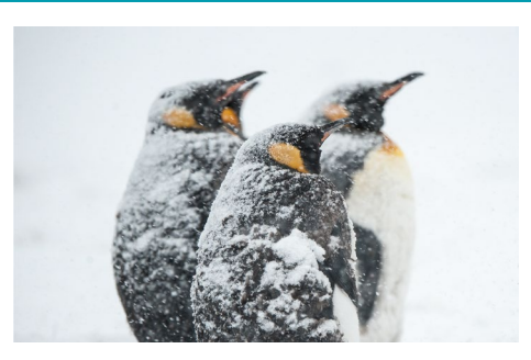
Penguins have a thick fat layer and waterproof feathers to survive the snow and icy ocean.

Sometimes the inherited variation may help an individual to survive in its habitat.