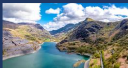
Snowdon, Wales. 1,085m