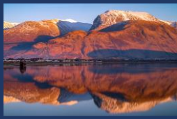
Ben Nevis, Scotland. 1345m