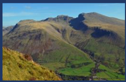
Scafell Pike, England. 978m