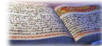
Guru Granth Sahib