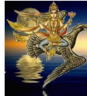
Soma, god of the moon