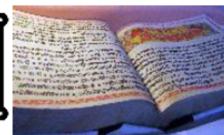
Guru Granth Sahib