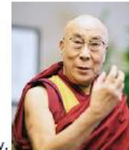
the Dalai Lama,