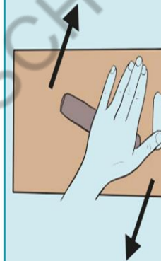
Roll a clay sausage shape