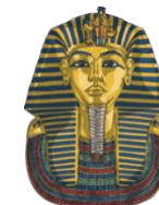
Tutankhamun's death mask

The discovery helped people to understand more about the Egyptians pharaohs .