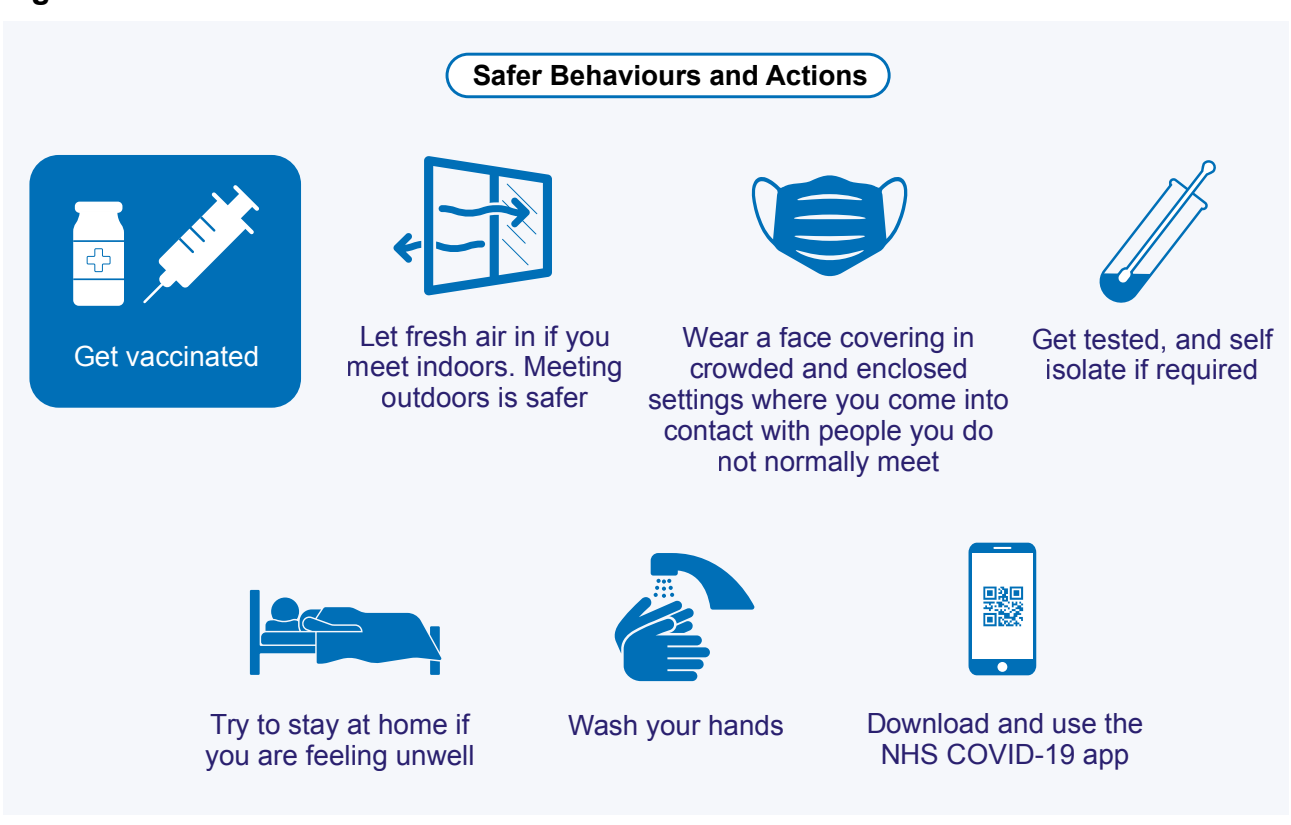
Figure 2: Safer Behaviours and Actions