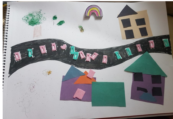
Ava-Simone—YR home learning