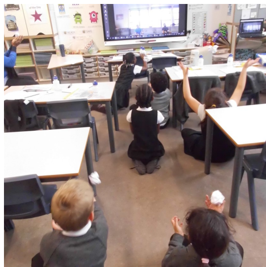
Year 2 Bubble enjoying their LPESSN PE session!