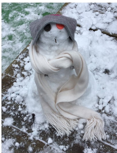
Reception Bubble had fun in the snow and built a Snowman.