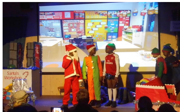
'It feels very festive now!'