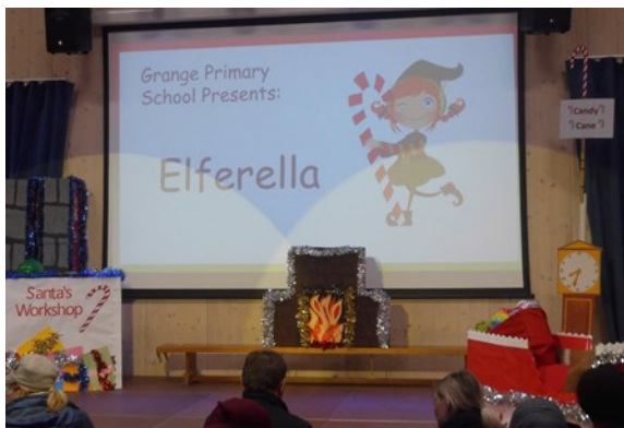
'It was great! Thank you!'